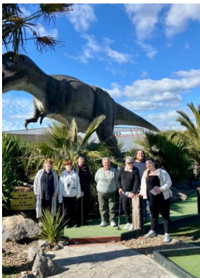
Enjoying mini golf at Jurassic Park

It's show time again and we finish the month with a trip to the local A & P show which is always well attended and one of the group's favourite activities.