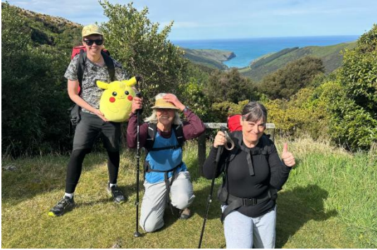
Members at Hinewai Reserve